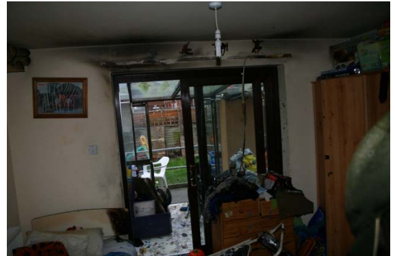
The fire in Eastbourne was started deliberately when a young child set fire to their bedroom curtains.