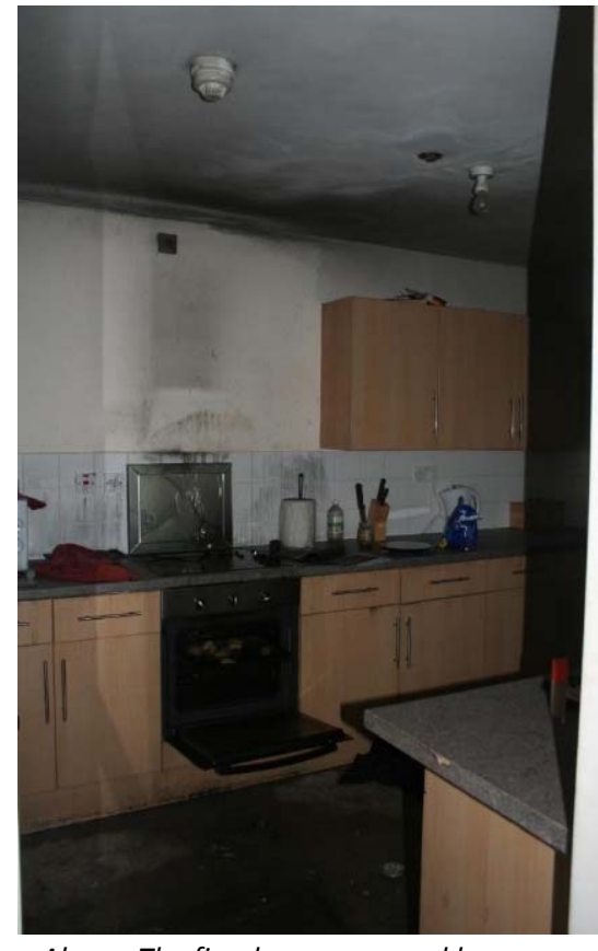
Above: The fire damage caused by a cigarette was localised and significantly reduced with the operation of fire

The occupants were taken to hospital as a precaution and were discharged a few hours later.